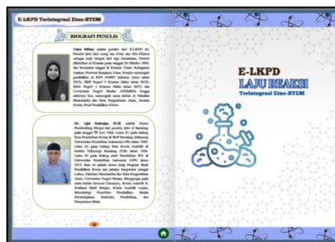
Figure 3. Back Page Cover of E-LKPD

The content section consists of a concept map, learning outcomes, learning objectives, description, instructions for use, features, activity and answer key.