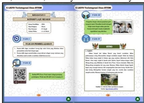
Figure 2. E-LKPD Activity

The content section consists of a concept map, learning outcomes, learning objectives, description, instructions for use, features, activity and answer key.