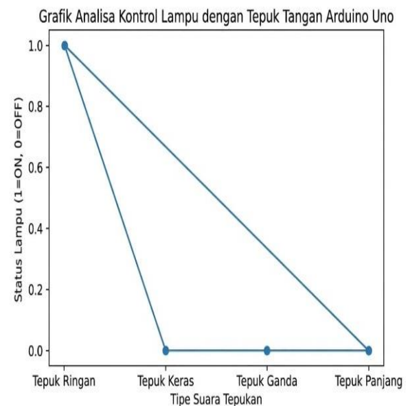
Image 1. Test Data Graph